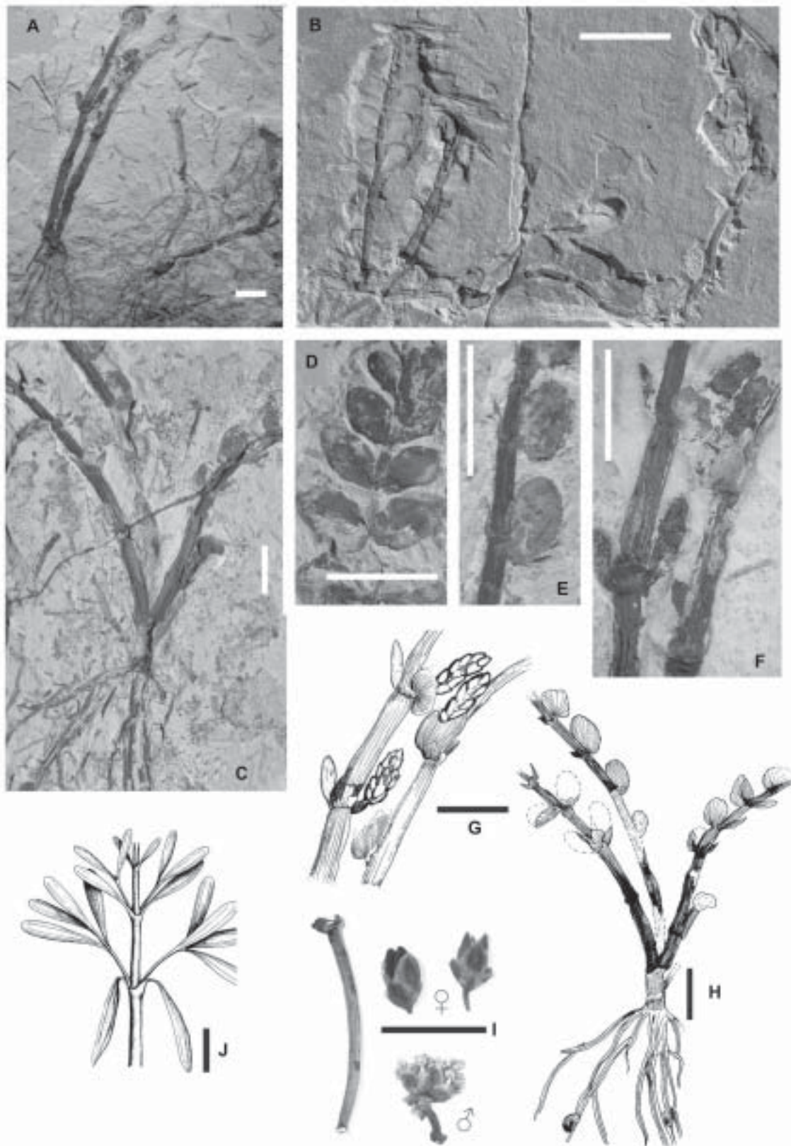
PLATE 1. New gnetalean taxon from the Crato palaeoflora: morphological aspects. A: Two opposite striate and articulate branches bearing a pair of strobili by nodal region, of arrangement opposite. Dense roots system exhibiting central furrows. B-C: Complete short woody shrubs with vegetative structures attached (roots, stem and leaves). D-E: Detail of the oblong parallel-veined leaves inserted oppositely to pairs in the nodes. F-G: Detail of the opposite strobili that consist of overlapping units spirally arranged along a central axis. H: The Gnetalean woody short shrub reconstructed. I-J: Morphological comparisons with similar taxa: I: Living Ephedraceae family – a grooved branch and also female (♀) and male (♂) strobili of the extant species Ephedra chilensis . J: Extinct gnetalean Drewria potamacensis with its vegetative parts reconstructed (modified from Crane & Upchurch, 1987). (Scale bar = 1 cm).